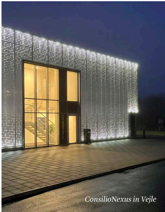
ConsilioNexus in Vejle