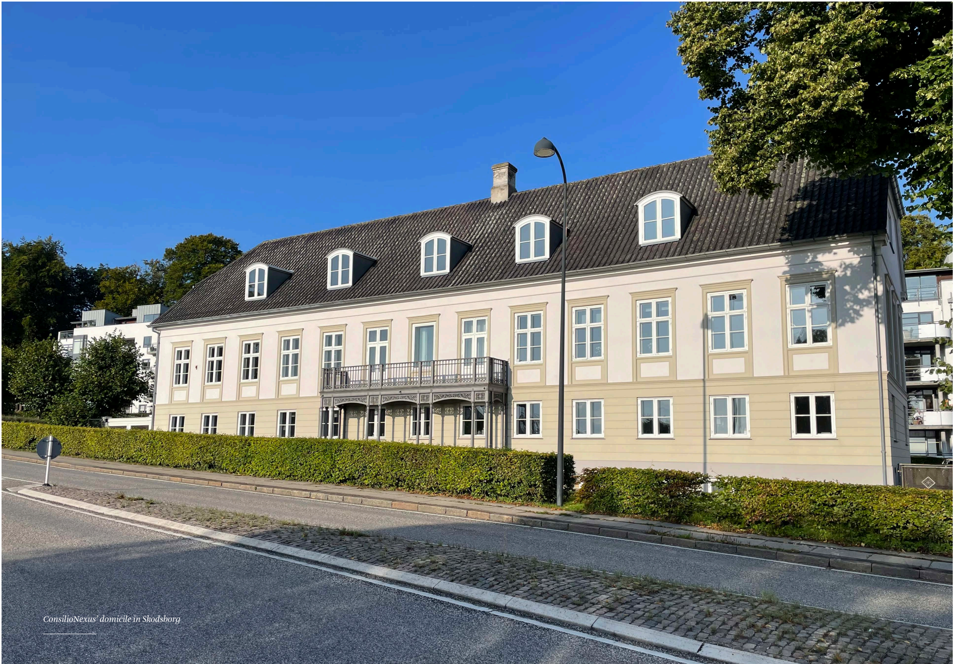
ConsilioNexus' domicile in Skodsborg